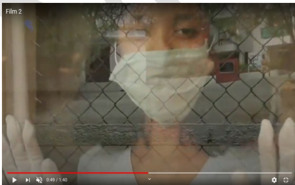
Use of Meta phors addre

In the second film the girl is finally shown in the mask behind the isolation zone. The responsibility is left with the girl and leaves the man the father free. The image of the girl dissolving in the cage speaks a lot about the gender bias.